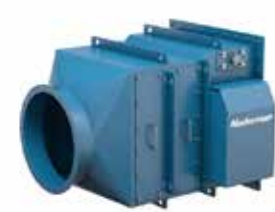
Explosion isolation flap valve CARZ

Safety components, fans and other components for use with combustible dusts and gases.