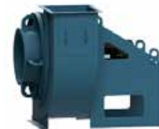
Fans type COMBIFAB-FZ