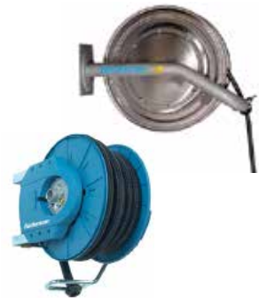
Hose reels for use in ATEX zones.