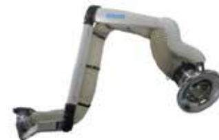
ATEX designed combustible dust extraction arm NEX DX.