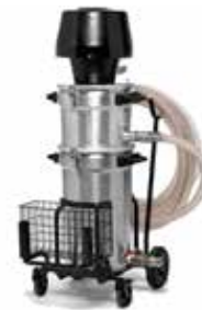
Industrial vacuum cleaners for removal of flammable liquids and combustible dust.