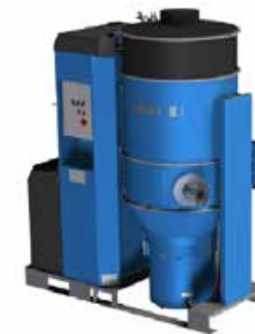
E-PAK DX high vacuum unit