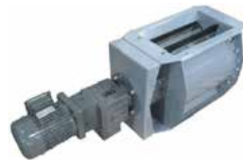
Rotary valve type NRSZ for emptying of combustible dust from the dust collector.