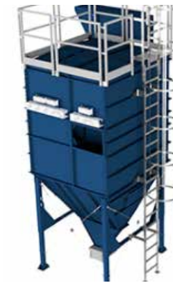
LCP cartridge and LBP bag-house dust collectors Applications - fine dust, shot blasting, pharmaceuticals.

Nederman Dust Collectors - suitable for most combustible dust applications. From small dust amounts to heavy material contaminations.