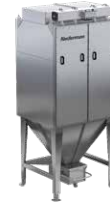
MCP SmartFilter dust and fume extraction solutions Applications - metal grinding, fine dust, bagging operations.