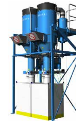
FlexFilter Ex units

Applications: sanding, grinding, metal chips, organic dust and more.