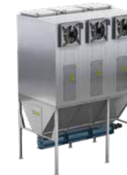
LBR SmartFilter dust collection solutions Applications - wood, furniture production, bulk, materials.