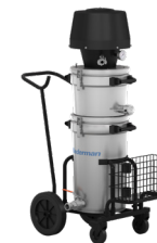
Industrial vacuum cleaners, standard and ATEX approved for demanding environments.