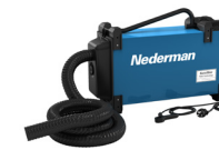
Mobile and portable fume extractors, efficient fume extraction at, near the source, or on torch.

As a Nederman partner, you gain access to a wide range of extraction and filtration products and solutions designed for industries handling dust, welding fumes, exhaust, oil mist, gases, and combustible dust. Expand your business and expertise in areas such as welding, woodworking, composite machining and metalworking. There are also opportunities to grow in other industries like food and pharma, data centers, recycling and oil mist applications. With our high quality products and dedicated support, you can enhance your offerings and drive long term success across diverse manufacturing industries. Below you have a glance of our high quality product ranges, check out nederman.com for more information.