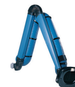
High performing extraction arms, easy to move and operate.