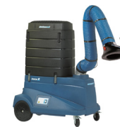
Easy to manoeuvre dust and fume extractors that includes an extraction arm original for easy and reliable hood positioning.