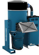
PAK-M DX with flameless venting system for organic dust (rsbp Flex F2)