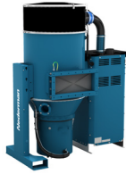
PAK-M DX with relief panel (rsbp)