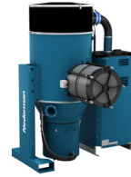
PAK-M DX with flameless venting system for metallic dust (rsbp Flex C1)