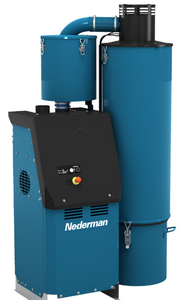
PAK-M with optional secondary filter